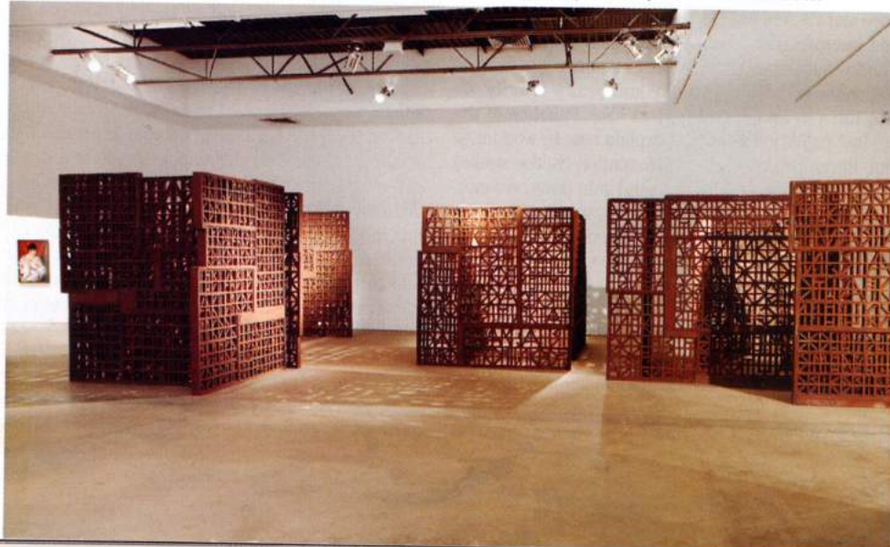
Cristina Iglesias: Santa Fe (Celosias I) and Santa Fe (Celosias II) , 2006, ceramic, dimensions variable.