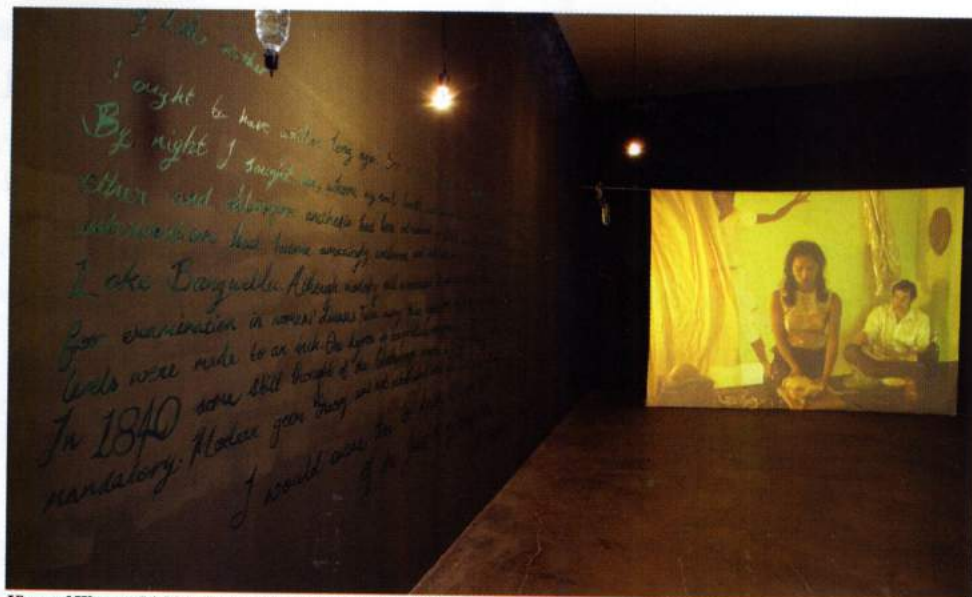
View of Wangechi Mutu's installation Magic , 2006.

Allowing for complete immersion in a multifaceted narrative, Mutu's installation felt like a world unto itself and, in some sense, the heart of the show. The brilliance of the exhibition design camouflages the location of Magic in one of the far corners of the building. Fire code requirements for two doorways in each gallery along with the lack of hallways and dead ends resulted in interlocked spaces without a specific traffic pattern. Multiple options for moving through the spaces set up unexpected and, according to the curator, unplanned relationships.