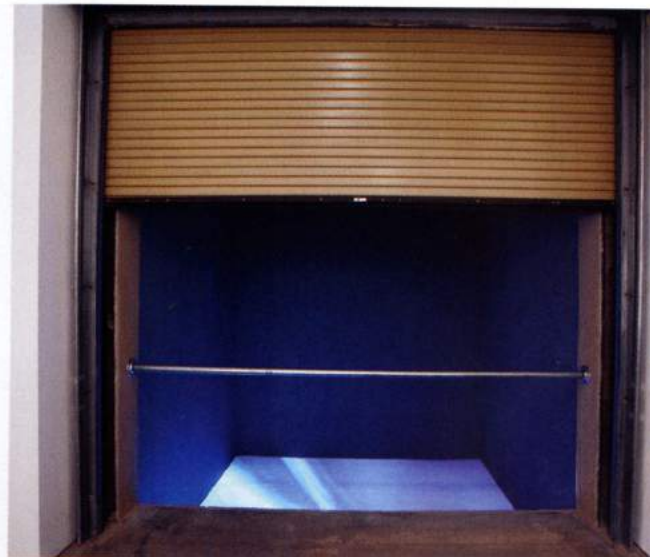
Interior view of Miroslaw Balka's Bottom , 2004, video projection, salt.