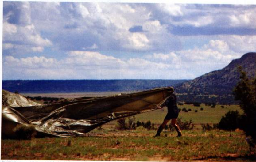
Still from video of Patty Chang’s untitled performance, Galisteo, N.M., July 9, 2006.

Facilitating complete immersion in the individual works, Ottman created separate rooms or “still points” for each artist in SITE Santa Fe’s 18,000-square-foot warehouse space, which allowed him to design just 13 spaces of varying sizes. This determined the number of invited participants. His selection process involved a somewhat