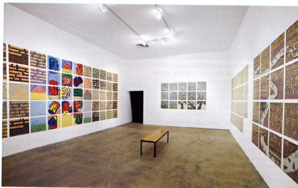
Left to right, Jennifer Bartlett's Twins , 2005-06; Thomas Bernhard, 2005; Purple Corridor , 2004-05; and Prince Charles, 2004-05; all enamel over silkscreen grid on baked-enamel steel plates.