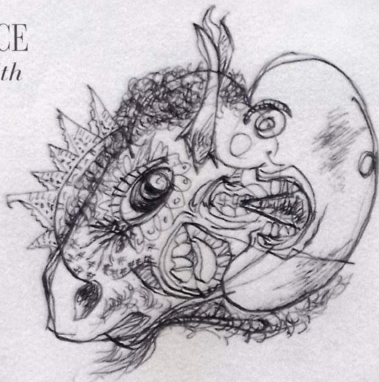
Jackson Pollock, CR598, (detail)