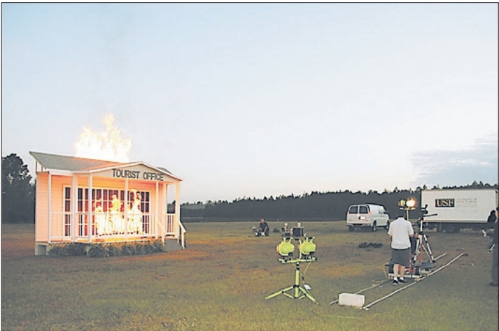
USF Contemporary Art Museum images Emanuel Licha, production stills from Preparing for Serious Events , 2007.