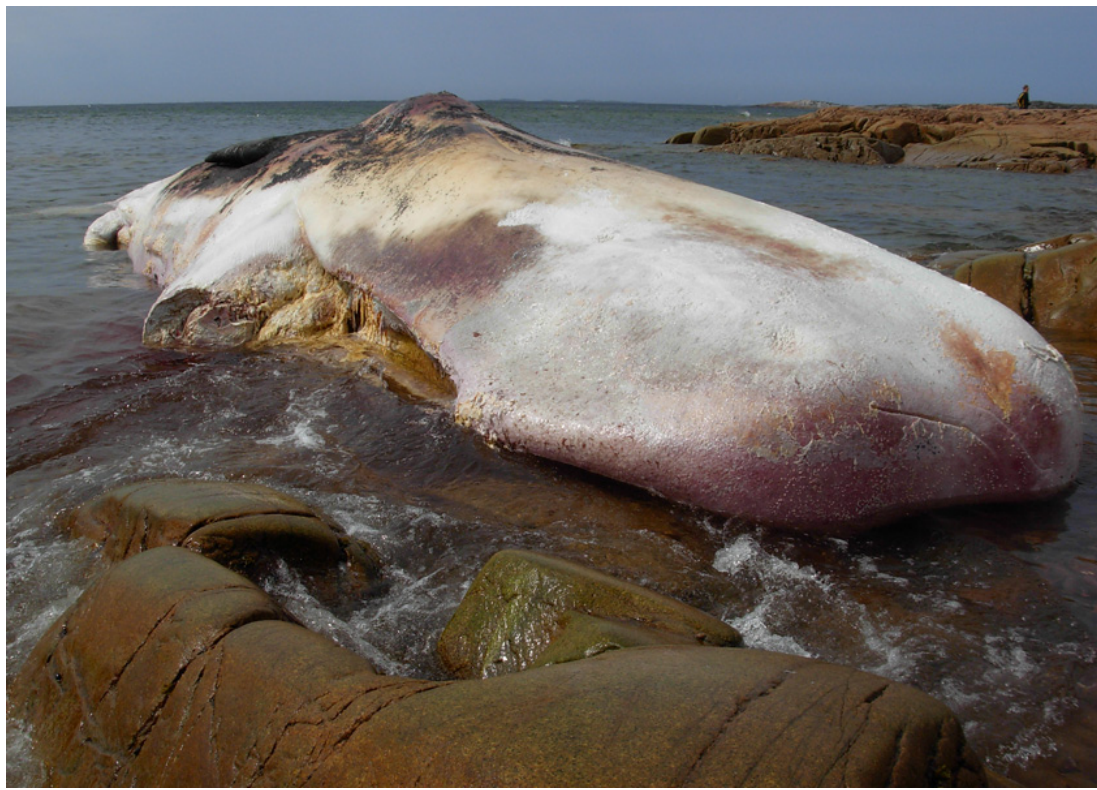
— Dead whale, Fogo Island