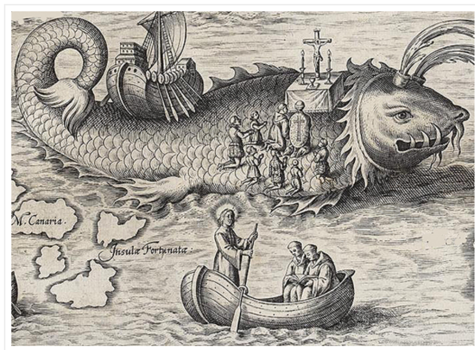
— St Brendan saying mass on a whale near Newfoundland

Fogo is a place that is also known for its whale populations.